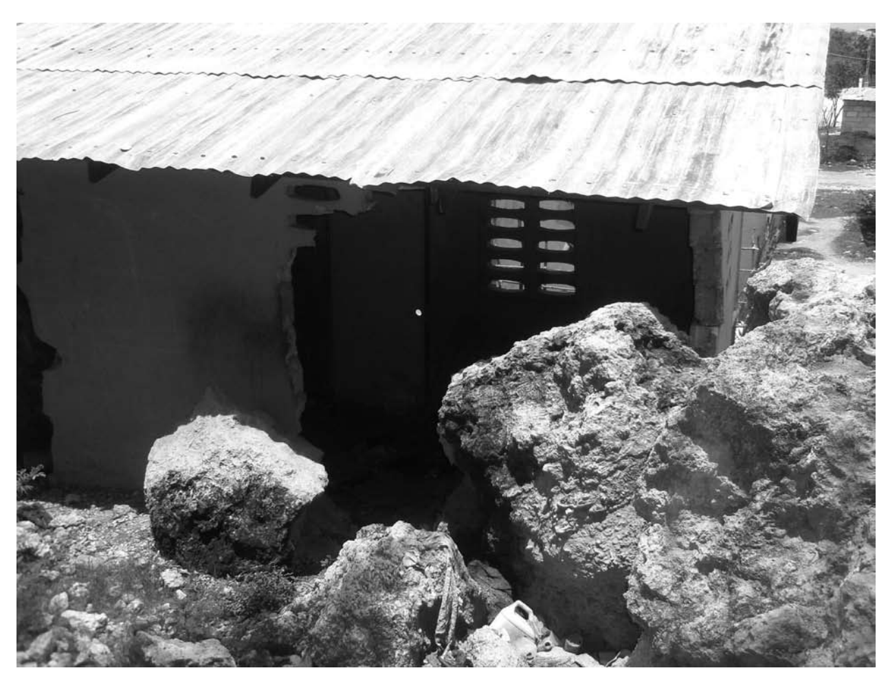
This house, built with assistance from an international NGO, was contructed in an area subject to rock slides.