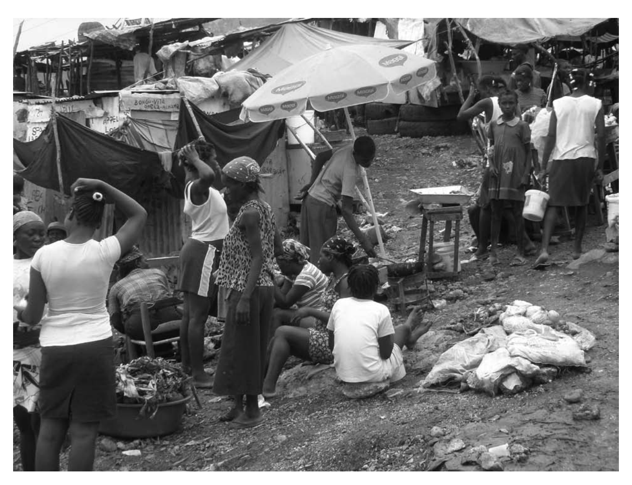
Many food markets in urban Haiti are built on top of landfills.

Morbidity, and Utilization of Services Survey (EMMUS-IV) 2005-2006 reveal that about one in five children under the age of five (22%) is underweight.<sup>34</sup> This percentage is higher than in the findings of the previous survey conducted in 2000 (17%) but generally lower than the percentage found during the 1994-1995 survey (28%).