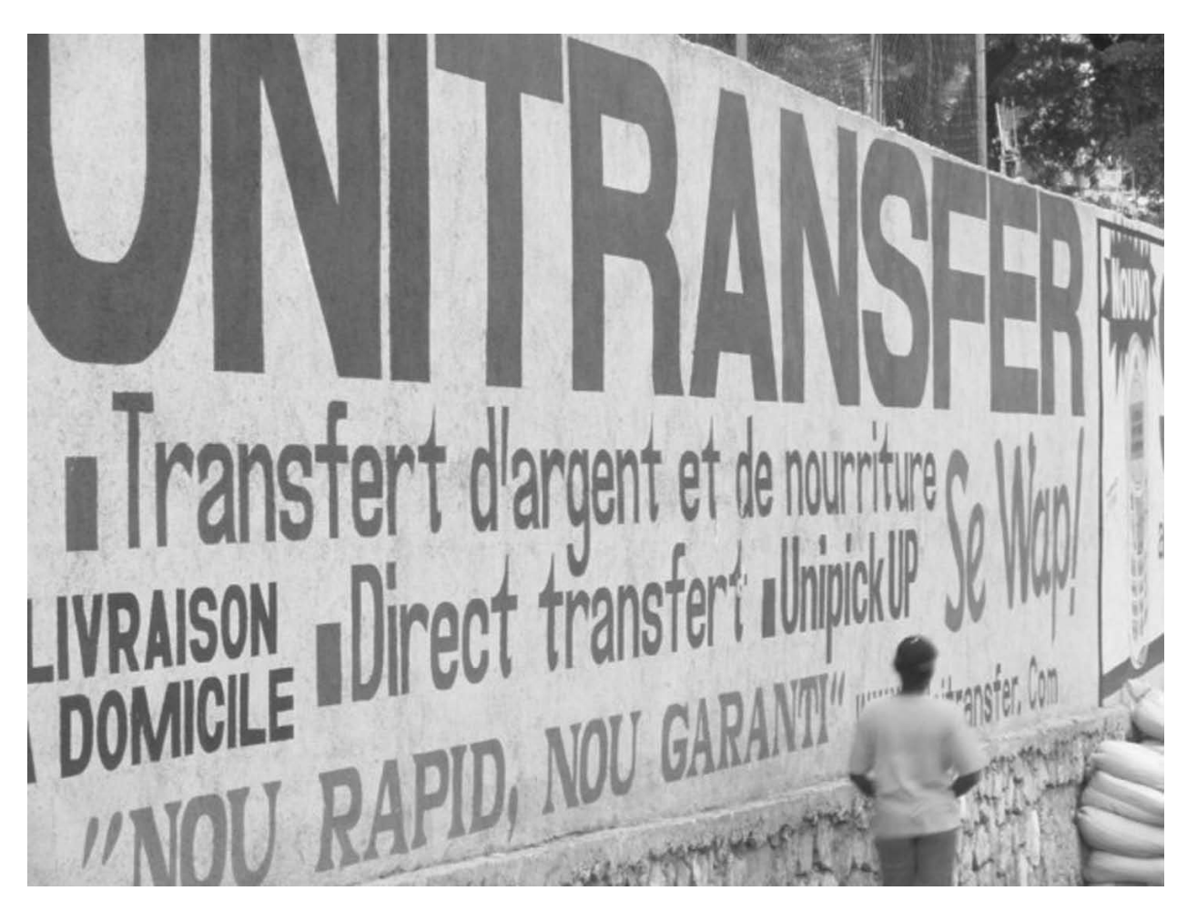
Remitances are increasingly sent directly as food.