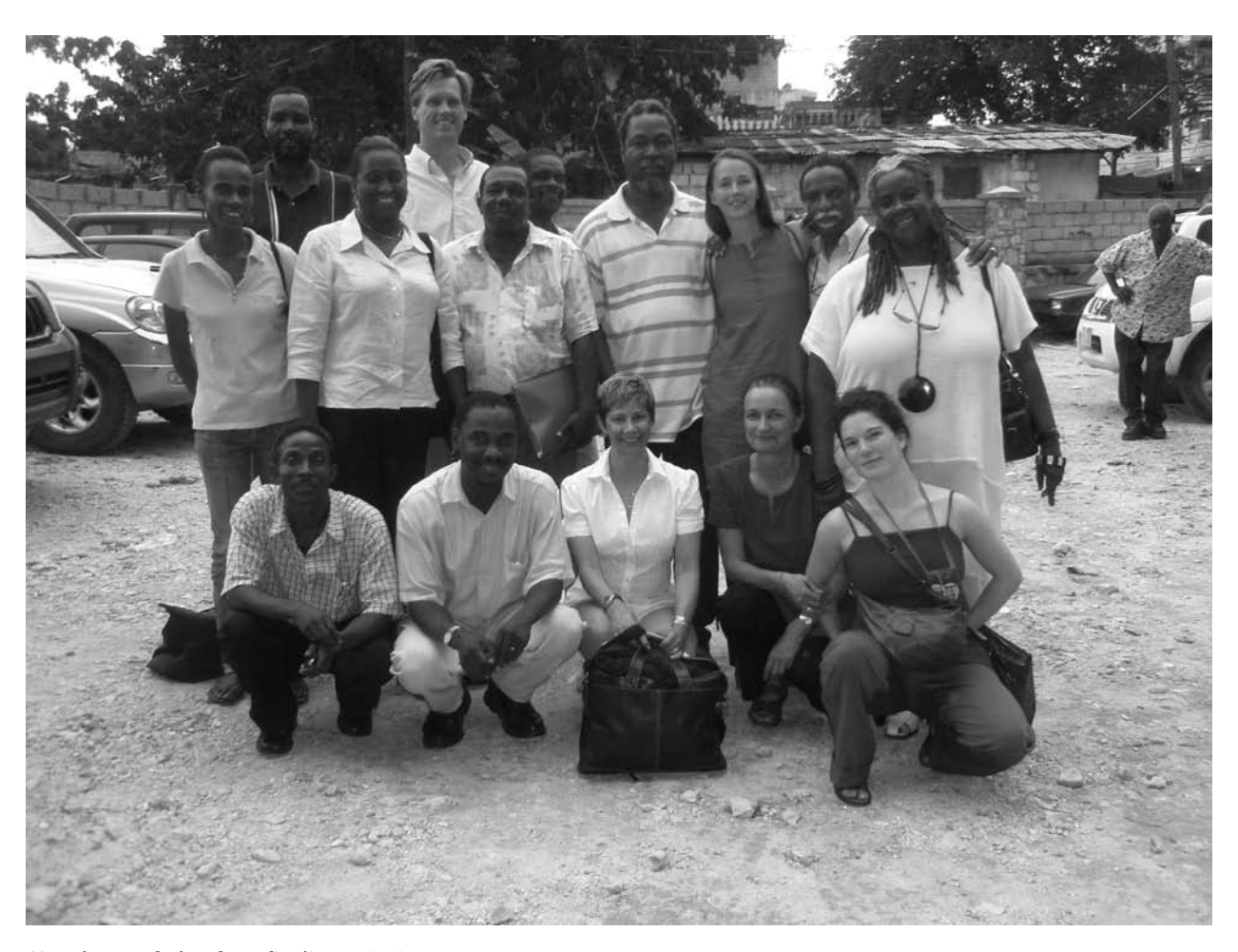
Members of the fact-finding mission.