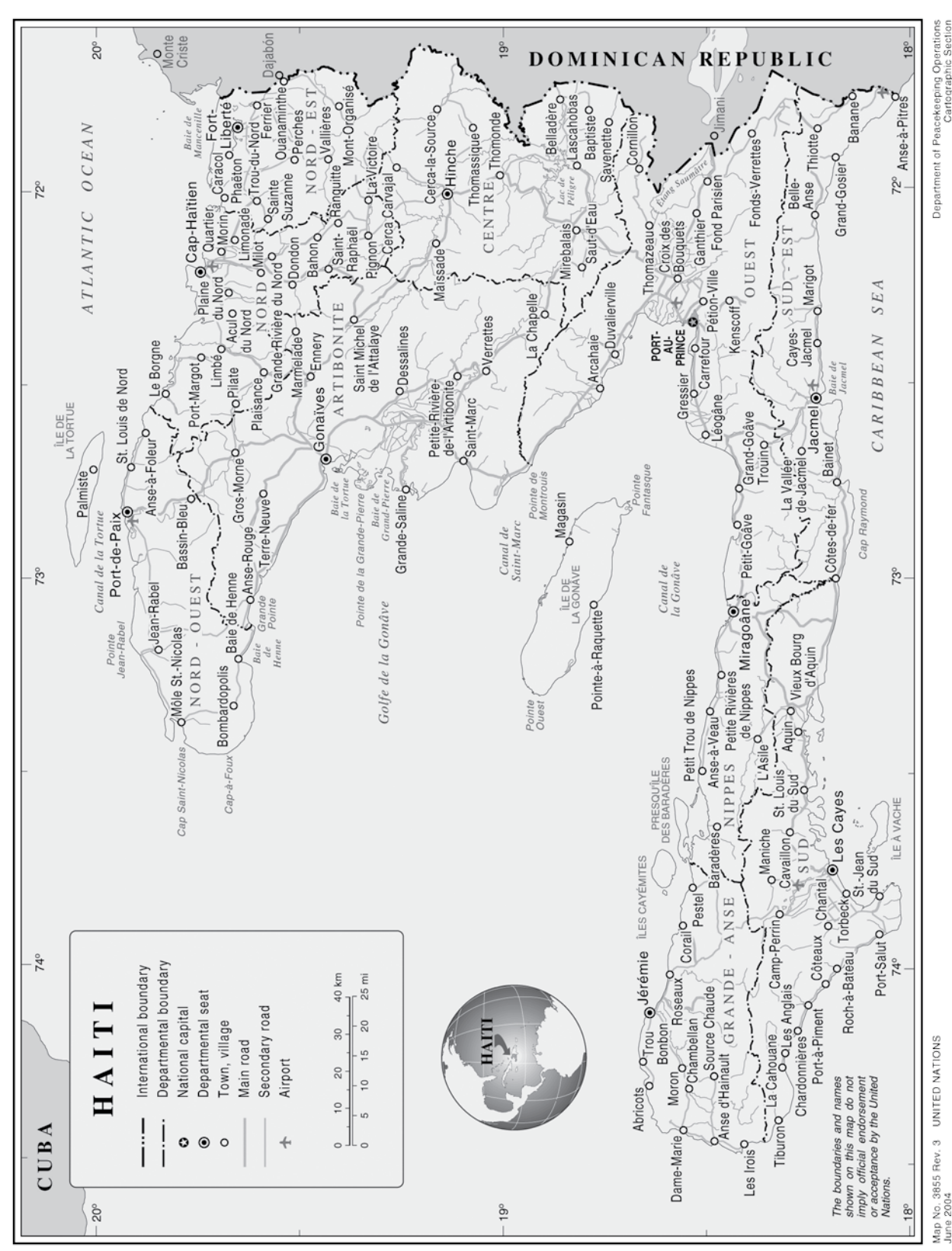
Map No. 3855 Rev. 3 UNITED NATIONS June 2004