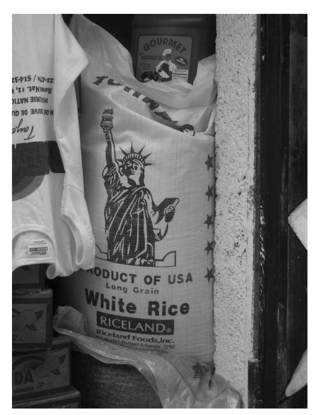
Most of the rice eaten in Haiti comes from the United States.

depends on money transferred from relatives living abroad.<sup>20</sup> In 2007 the United States, the Inter-American Development Bank (IDB), Canada, the European Union (EU), and the World Bank were Haiti's principal lenders. The country's external debt reached 1.189 billion USD in 2006.